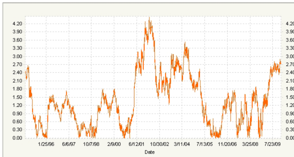
Slope of Sw1yr minus One year Fwd Sw1yr divided by 1yr-1yr ATM receiver swaption

My simple trading rule is that whenever the ratio of carry to option cost nears three to one, I buy the option. At the current ratio of 2.8 to 1.0, it is now time to execute this trade. Specifically, buy the 1yr-1yr receiver struck at-the-money and don't hedge it.